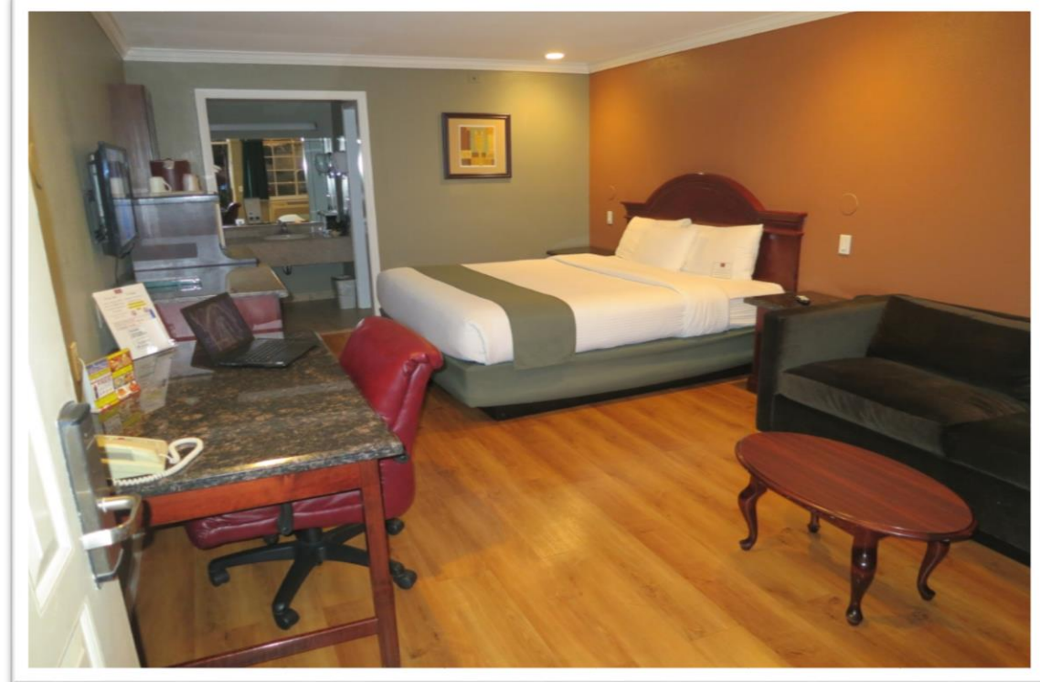
ONE KING BED WITH SOFA BED